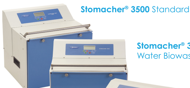
Stomacher® 3500 Standard

3 year warranty and 10 year service support